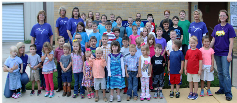
ELEMENTARY (GRADES PRE-K - 5TH)