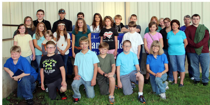
SECONDARY (GRADES 6TH - 12TH)