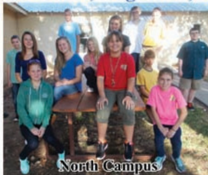
North Campus Junior High