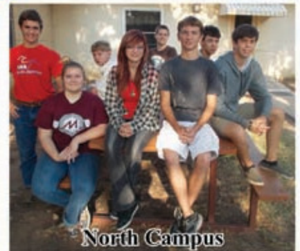
North Campus High School

"All your children shall be taught by the Lord,