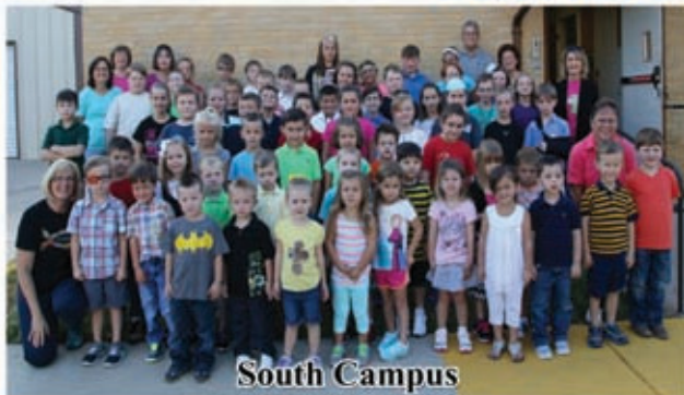
South Campus Pre-K - 6th Grades