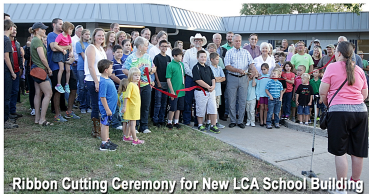
Ribbon Cutting Ceremony for New LCA School Building

A larger than expected crowd gathered in front of the new LCA building on Green Street on Tuesday morning, September 5th. This was the first official day of school for the 2017-2018 school year in the new location. The students had started their year working at home on lessons, waiting for the new location to be completed.