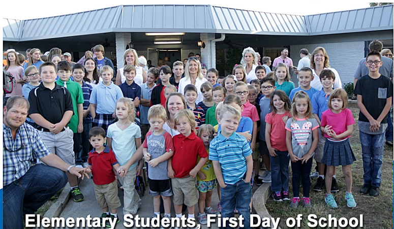
Elementary Students, First Day of School