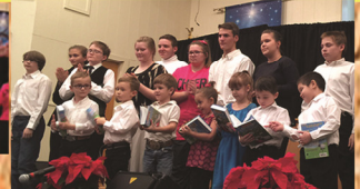
LCA Christmas Program Highlights