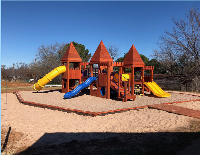
A structure to stretch the imagination everyday.