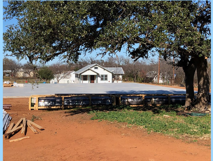
The foundation is ready! We will have our pavillion soon for our students to use for physical education and basketball practice.