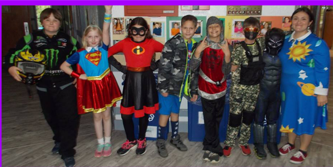
Super Hero Day was a hit at LCA!